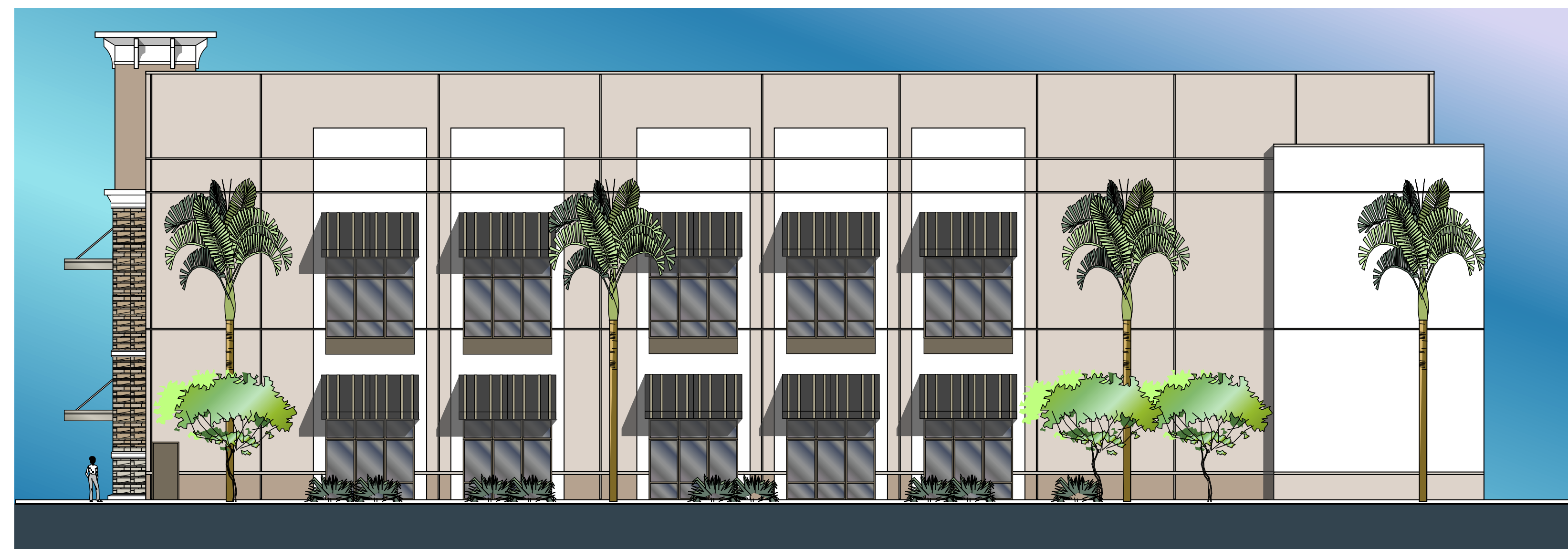
S SOUTH ELEVATION BUILDING 'E'