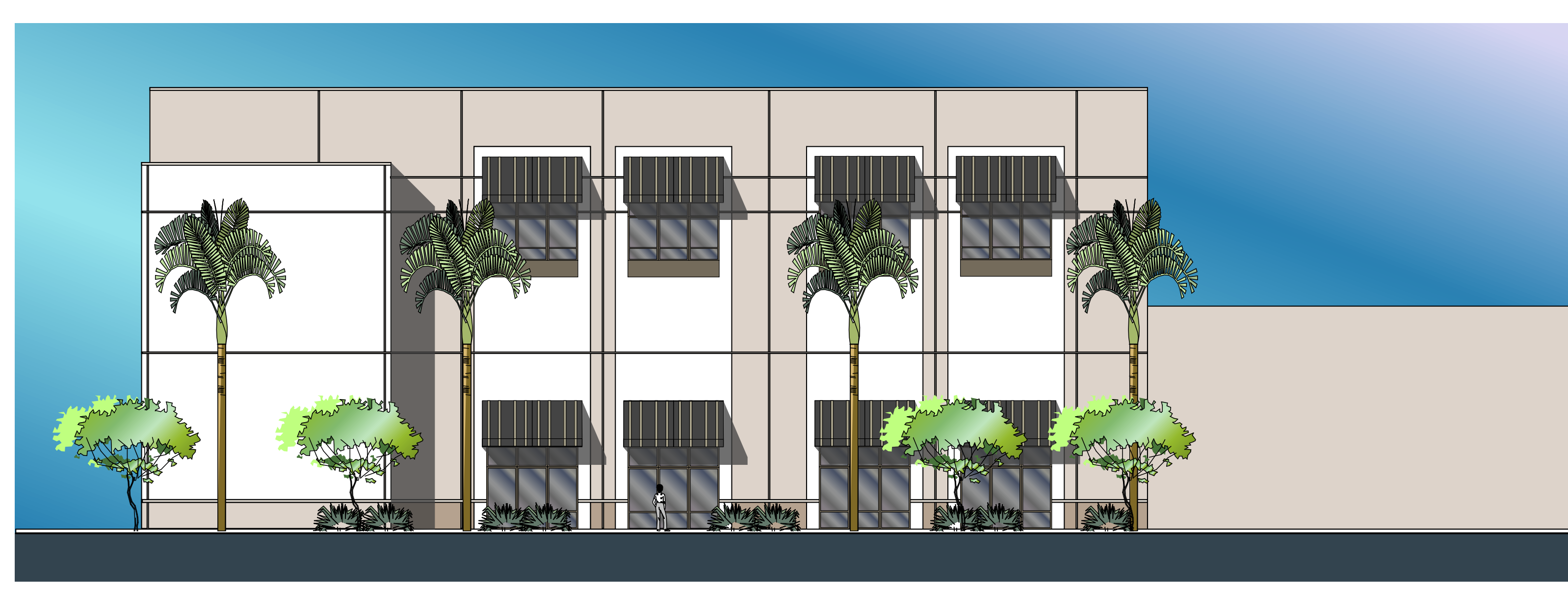
E EAST ELEVATION BUILDING 'E'